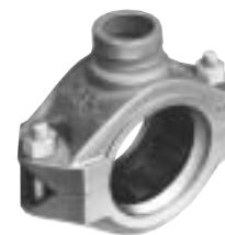
Style 72 Female Threaded Outlet Coupling Style 72 Grooved Outlet Coupling