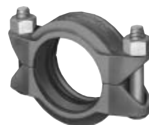
Style HP-70 Rigid Coupling