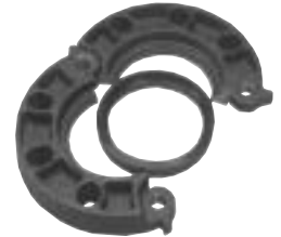
Style 741 Vic-Flange® Adapter