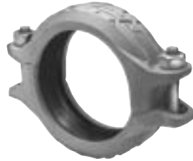
Style 07 Zero-Flex Rigid Coupling